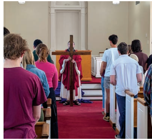
Students adore the wood of the cross during the Liturgy of the Lord's Passion on Good Friday.