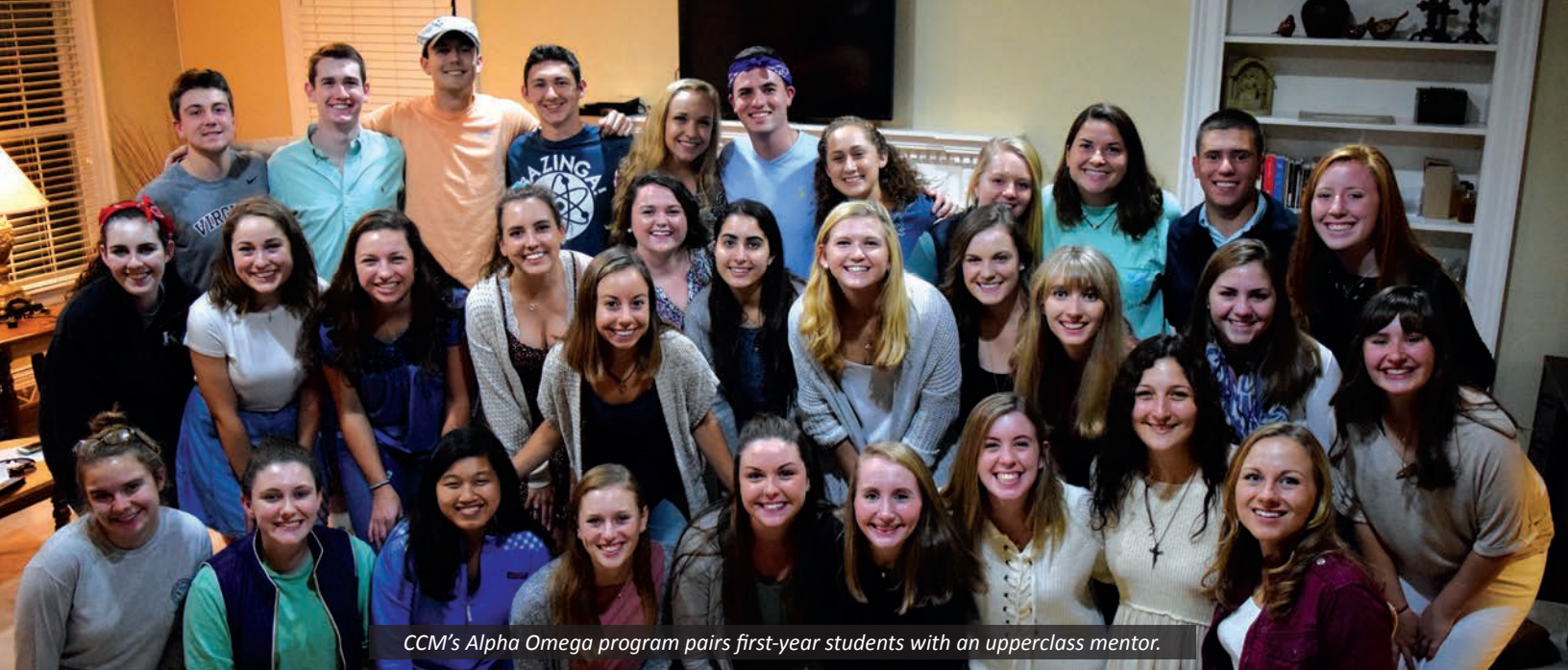
CCM's Alpha Omega program pairs first-year students with an upperclass mentor.