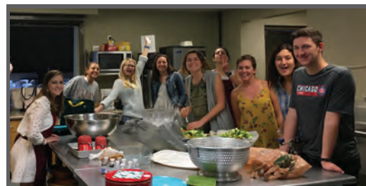
The student crew prepares a delicious Sunday Supper held after the Mass of the Holy Spirit.