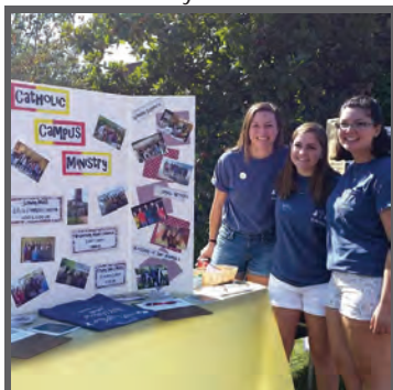
CCM Servant Leaders are ready to welcome new students at the Organization Fair.