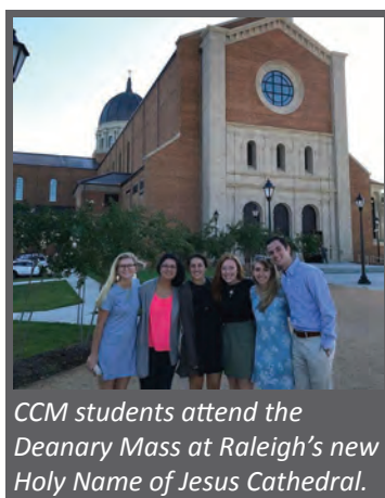
CCM students attend the Deanary Mass at Raleigh's new Holy Name of Jesus Cathedral.